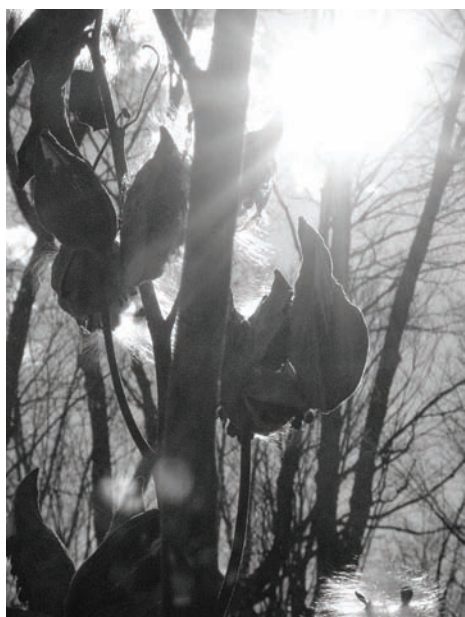
Milkweed plants on a sunny afternoon.