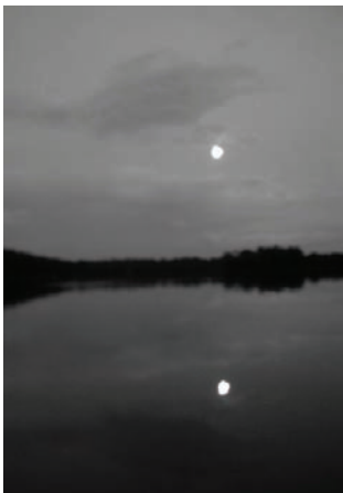
Our lake, lit by the moon.

Just so you know, I am willing to relinquish my crown . . . oops, I mean my job . . . as president to anyone who would be interested in completing the term. Seriously, if any of you would like to complete this term of president, just send me an email. Otherwise, I will continue to do my best for the Cochran Lake Management District and all of you.