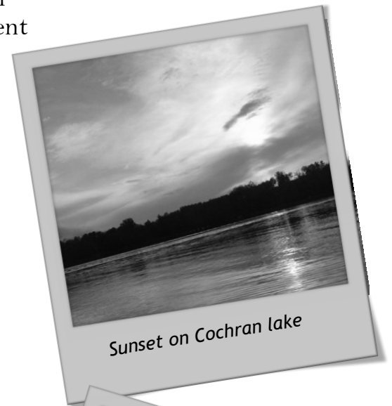
Sunset on Cochran lake